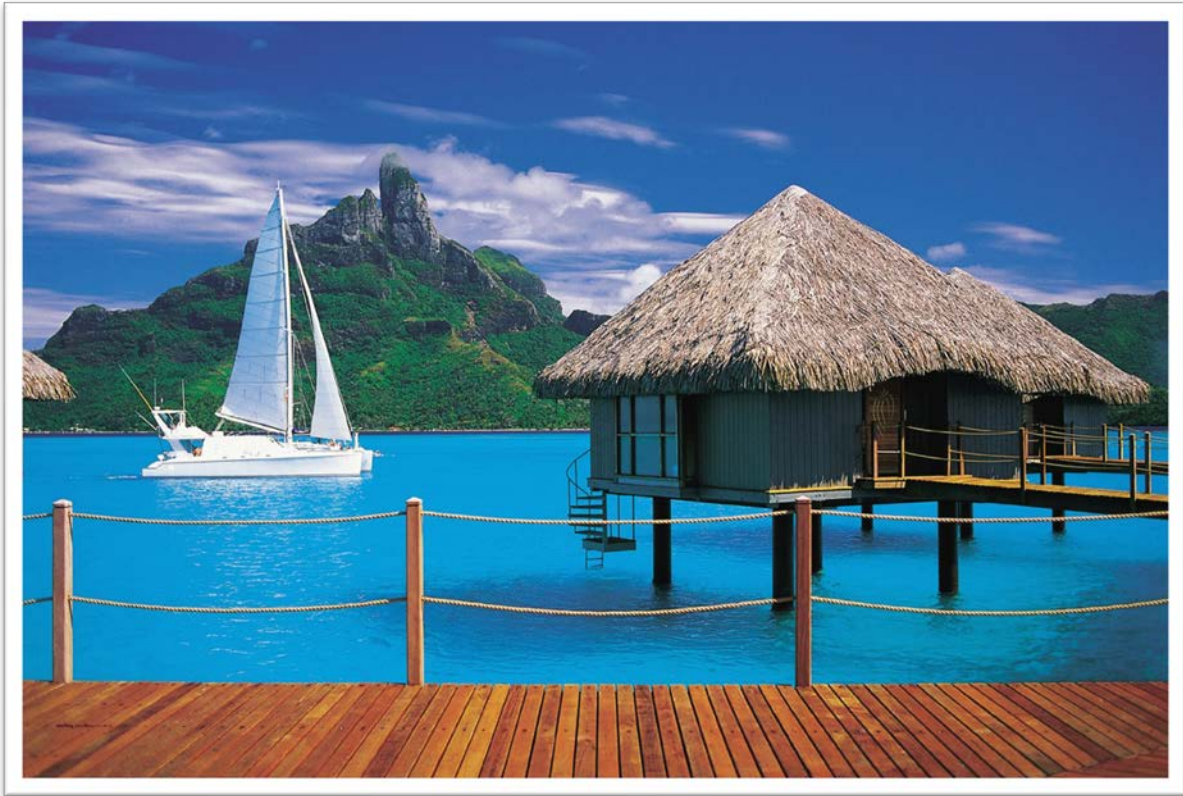
Le Meridien, Bora Bora

Modern Sailing Global Destinations is Proud to Present