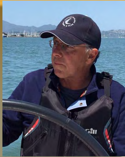
SPOJA LEG 1 & 2