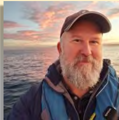
McCLISH LEG 2